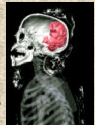
Screen shot of animation